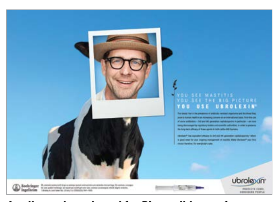
Another ad produced for BI was this one for Ubrolexin, an antibiotic used to protect cattle

In terms of future plans for the flagship agency,