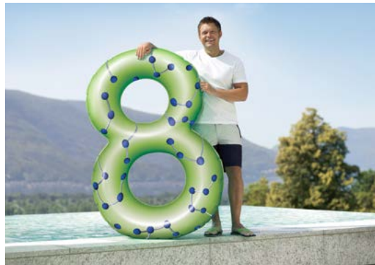
Digital work from Biolumina (left) and an ad promoting Novo Nordisk's Novoeight (above)