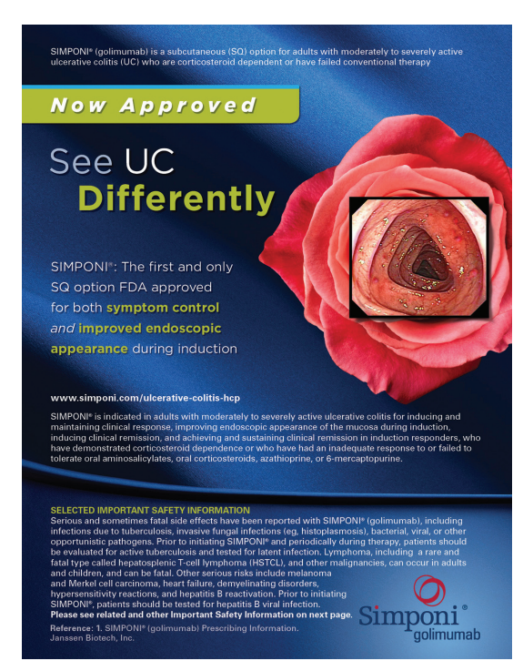
Sudler & Hennessey work for Simponi, a Janssen medication that treats ulcerative colitis

"I think we now see creativity as this tremendous thing where you can affect the beginning, the middle and the end and tell it all with one story instead of this