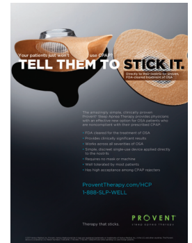
Among the clients for whom Jocoto does work (from above left): Abaxis, Mako and Provent