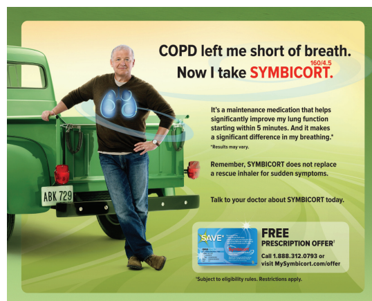
Above: A journal ad for AstraZeneca's Symbicort, part of a campaign that also includes digital and CRM

Chapman hopes to move professional agencies at CommonHealth into a higher strategic and consulting role, but says plenty of calls are still coming in for professional AOR work "as a kind of siloed point of view," but that kind of assignment typically includes