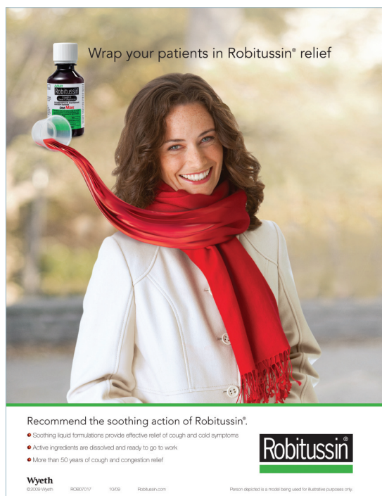
Above: A professional ad for OTC syrup to relieve cough and cold symptoms, Robitussin, by Wyeth