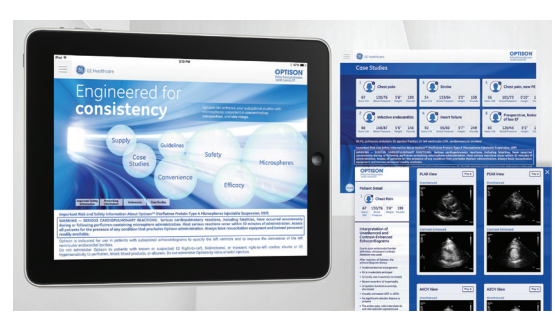
Above left: HLG's Biovance launch focused on restorative amniotic tissue. Above: The Optison iPad app for GE Healthcare

And while he is upbeat and passionate about the industry's outlook—"I feel like it's almost a duty