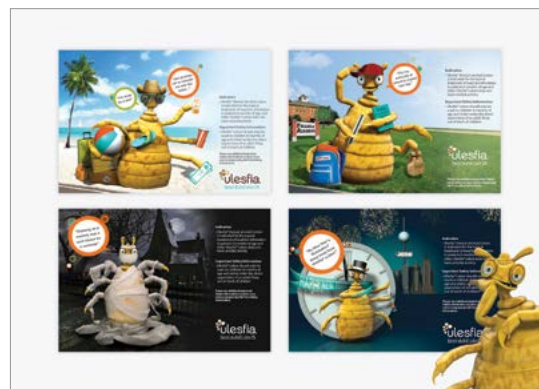
An ovarian-cancer awareness piece (left) and work for head-lice remedy Ulesfia (above)