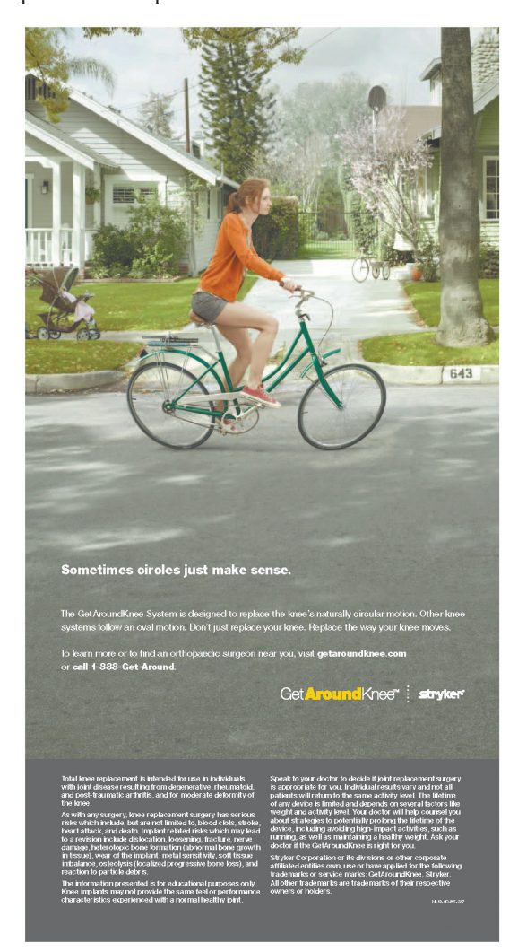
Opposite page: a T-shirt supporting Hurricane Sandy relief; ad for the GetAroundKnee (above)

Which isn't to say that GSW believes the future is in product development and commercialization. "We can