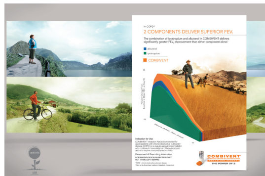
Sentrix work for (from top) WellSpring’s Dyrenium and Boehringer Ingelheim’s Combivent inhaler

even though you know it’s a reality of the economy right now.” And she has already located a silver lining: “Some of the people who splintered off on the client side told us, ‘I’ll be in touch as soon as I land.’”