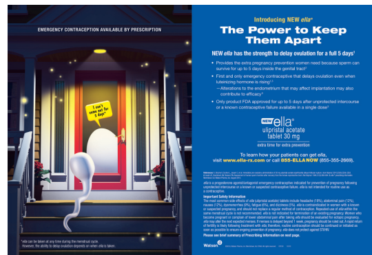
Above: A professional campaign for Watson's Ella; Top: From a journal ad for Essilor's Airwear and Thin&Lite